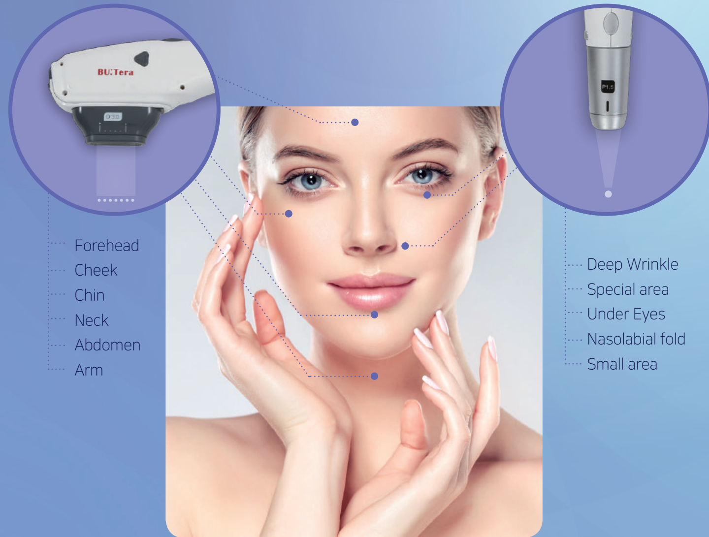
Use freely from small to large area.